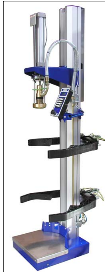
UFM universal filling machine with double centring device for automatic filling of industrial cylinders with centre valves