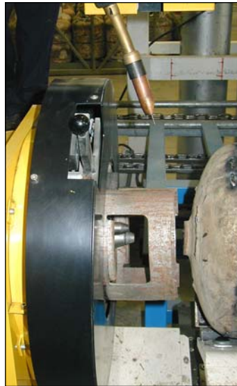
Semi-automatic surface welding equipment