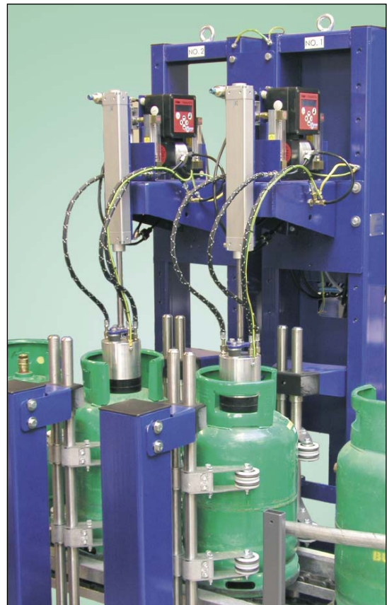
Height adjustable, fully automatic, two-headed ET-GD leak detector