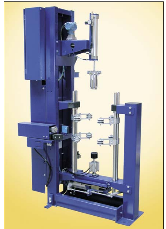
Fully automatic ET-PT valve tester