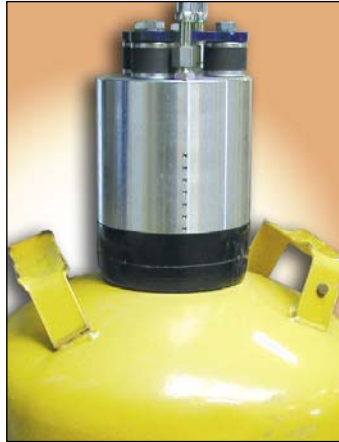
Gas detector with infrared radiation