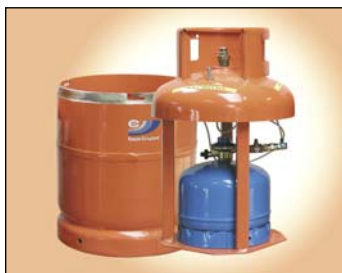
Test cylinder for calibration purposes