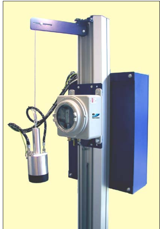
Manually operated ET-GD leak detector