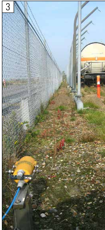
Gas detector at loading and unloading point for rail tank wagons