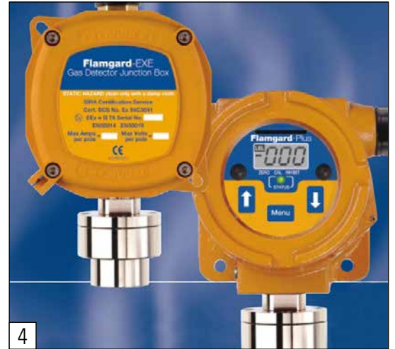
Examples of gas detectors