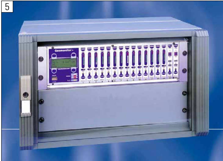
Examples of gas monitors