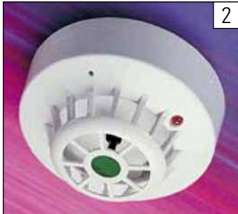
Example of fire detector