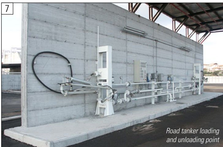
7 Road tanker loading and unloading point

Kosan Crisplant's tank supervision system gives complete overview of the tank yard and can be adapted to any need. The valve overview indicates present status for all valves and the tank overview lists all information about pressure, temperature and filling degree for each tank.