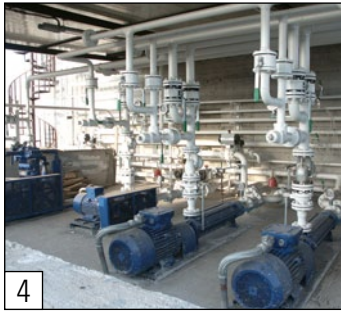
4 LPG pump installation