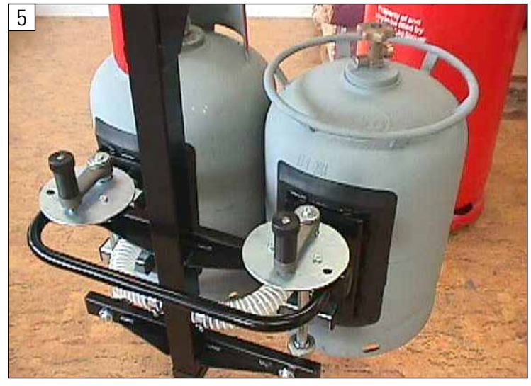
Handling system, based on the vacuum principle, for two cylinders