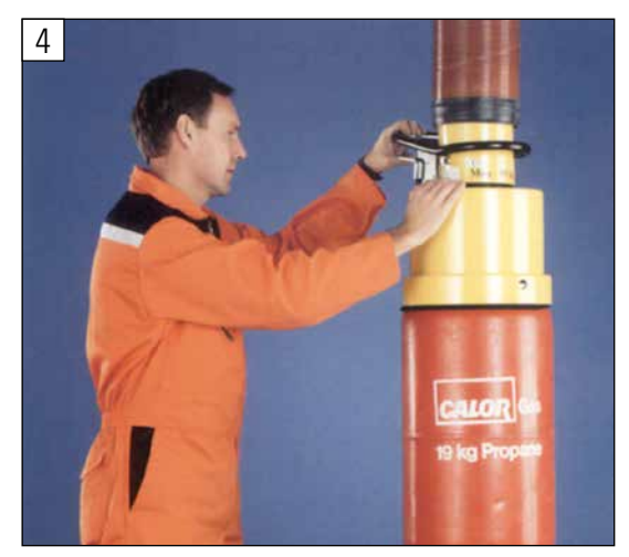
Safe handling of heavy cylinders